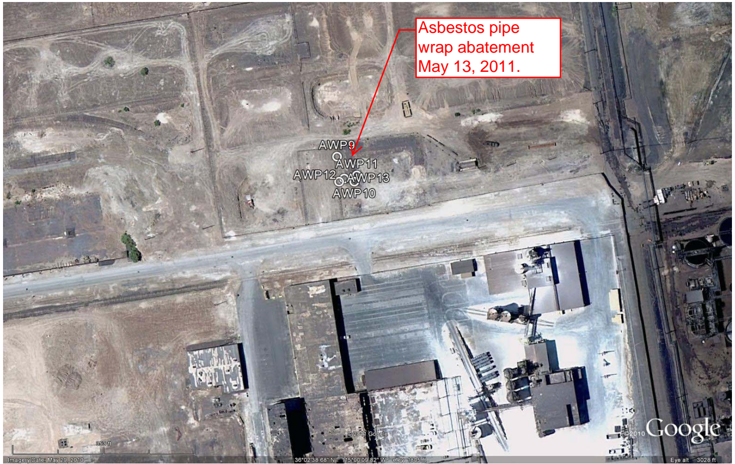
Aerial View - Tronox Asbestos Wrapped Pipe Abatement Map by Earth Resource Group AWP12 - 36° 2'39.72" N, 115° 0'10.38" W Area was visually cleared May 13, 2011.