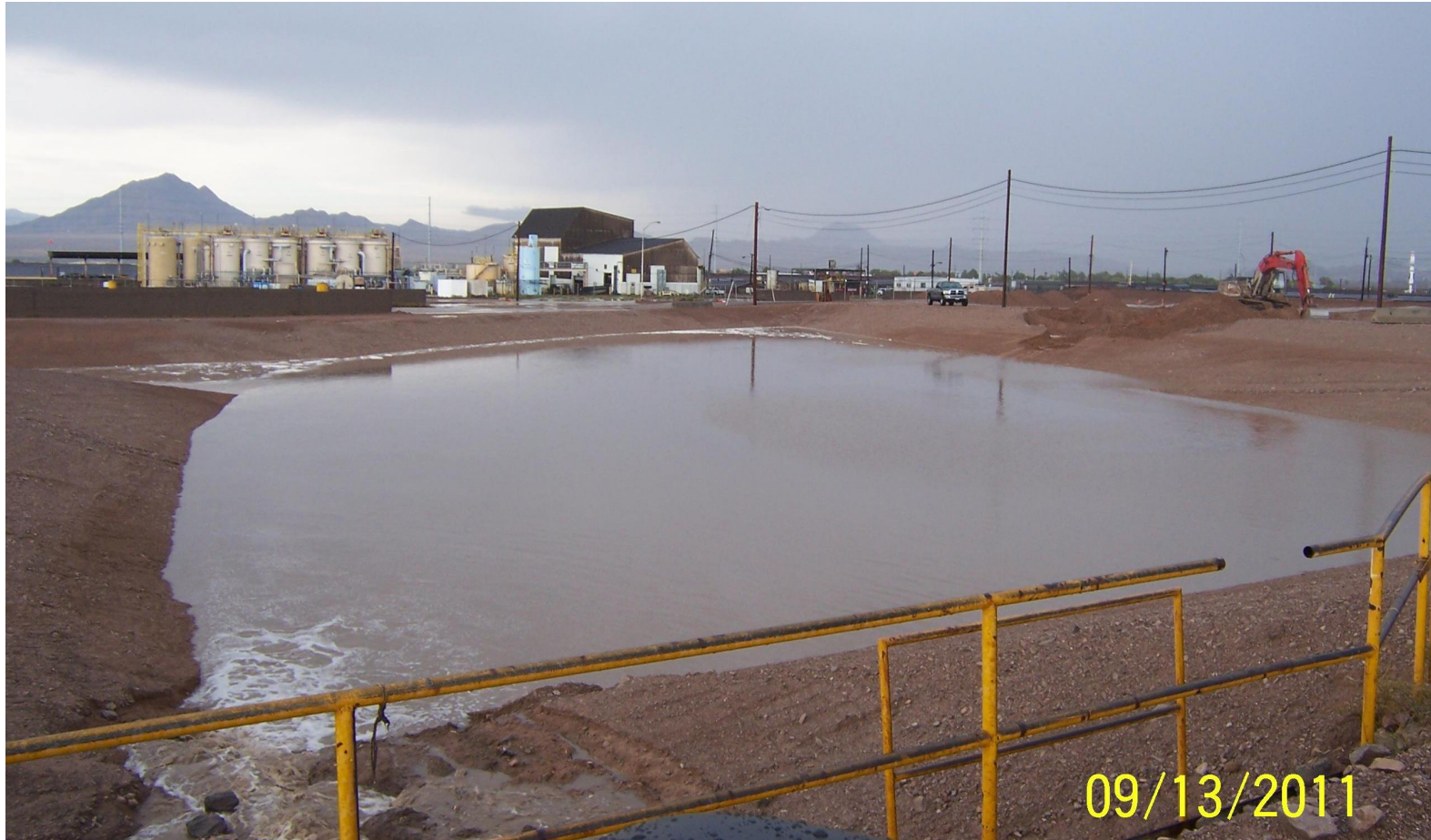
North RZ-C- Central Basin Area Storm Water Collected after a Sever Storm