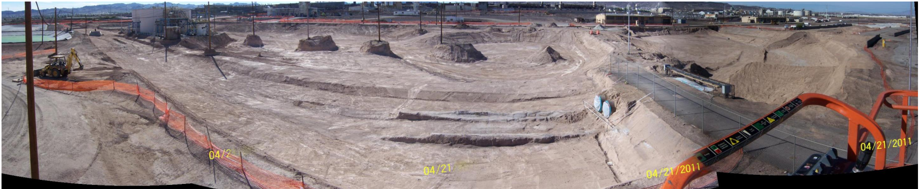
North RZ-C- Central Basin Area Polygon Excavation on Hold for Power Supply Wires Relocation