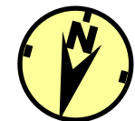
North RZ-C- Central Basin Area Storm Water 60" Plant Drain Pipe with Rip Rap