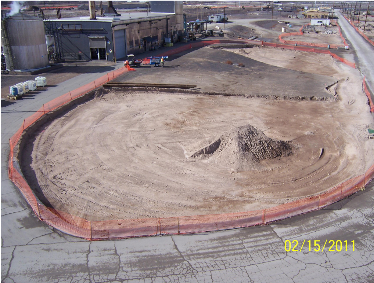
North RZ-C- 41 & 42 Polygon Excavation