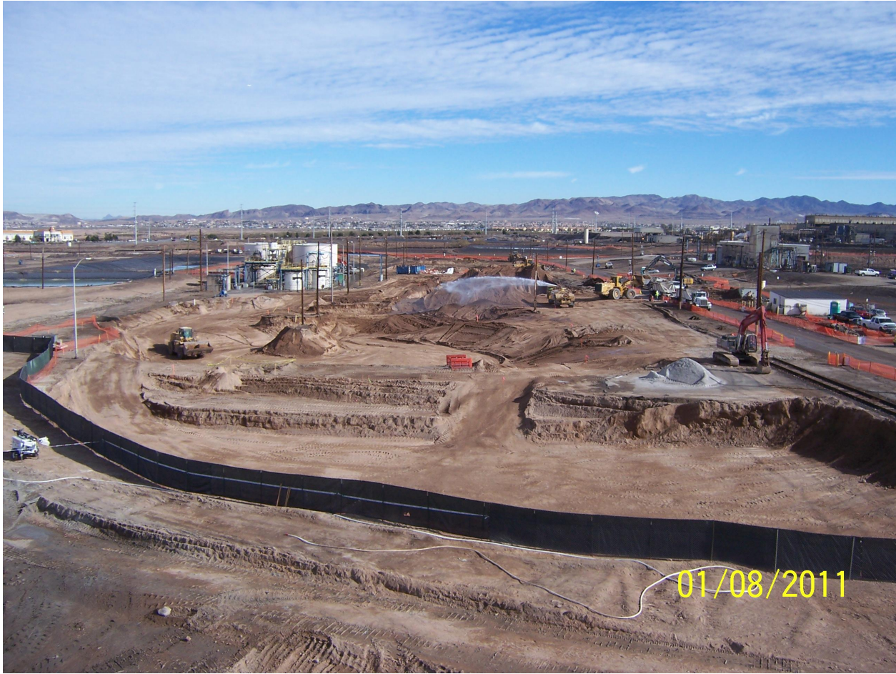
North RZ-C- Central Basin Area Polygon Excavation