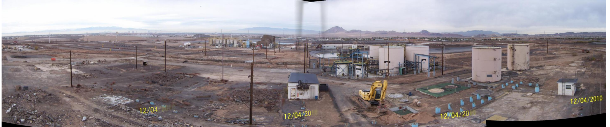
North RZ-C- Central Basin Area Prior to Removal of Obstructions before Remedial Grading