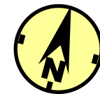
North RZ-C- Central Basin Area Removal of Obstructions before Remedial Grading