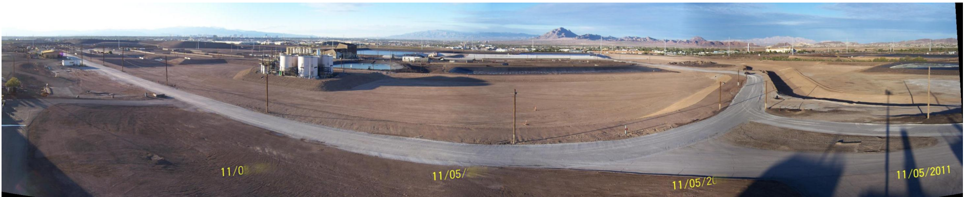
North RZ-C- Central Basin Area From the South East End after Finish Grading