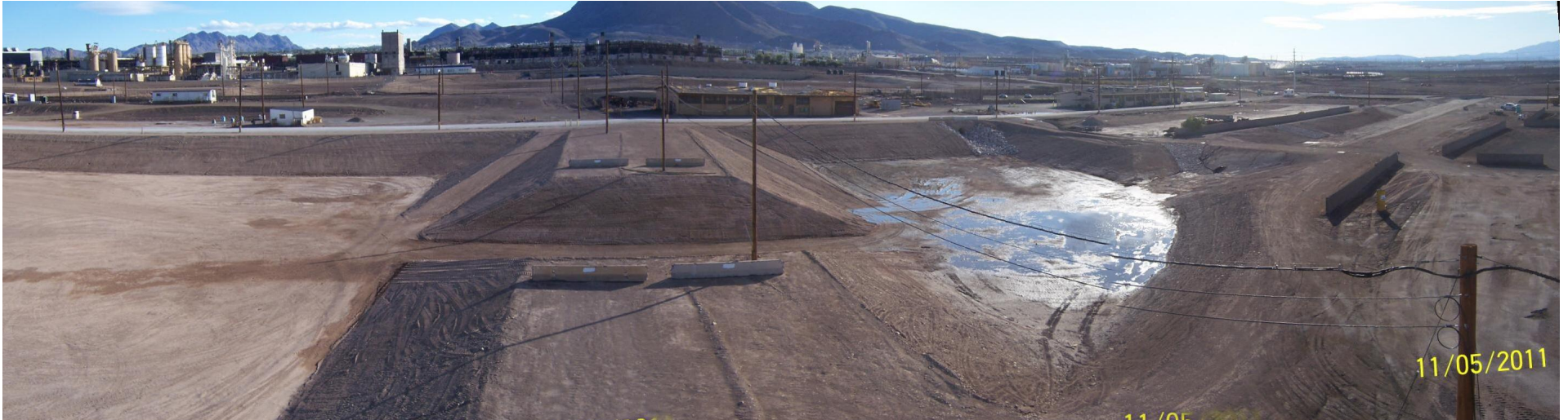
North RZ-C- Central Basin Area Storm Water Collected after a Small Storm and the Storm Water Passage