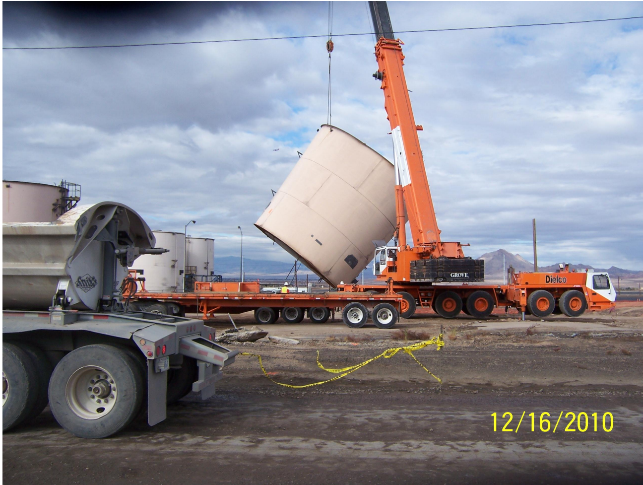
North RZ-C- Central Basin Area Removal of Obstructions before Remedial Grading