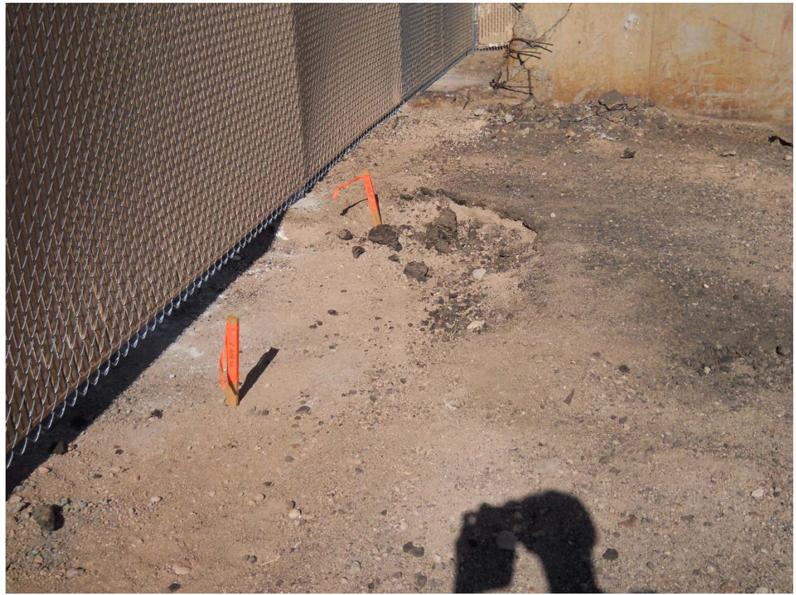
Photographs of Proposed Soil Sampling Locations.