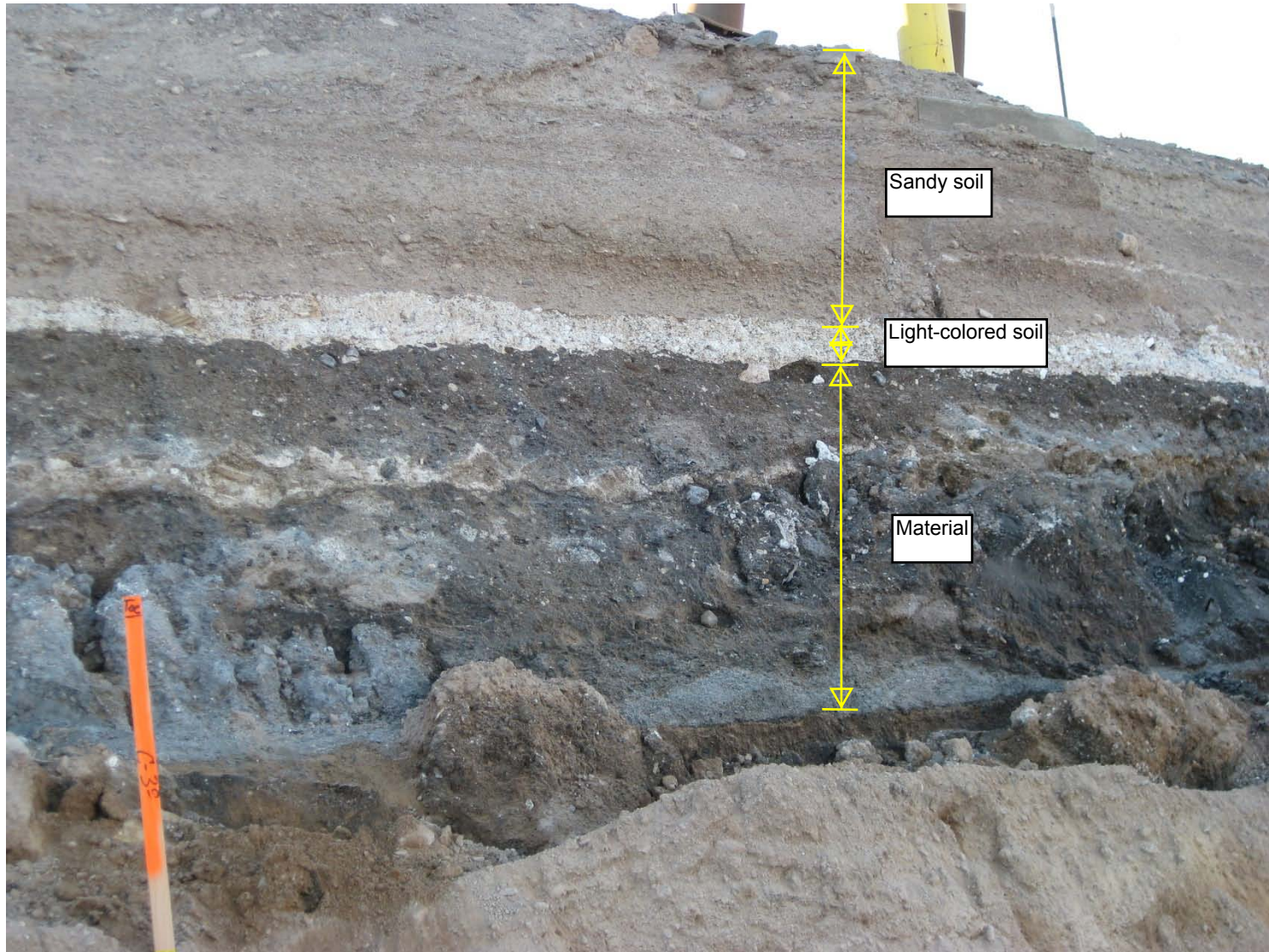
Figure 3 – View of Material