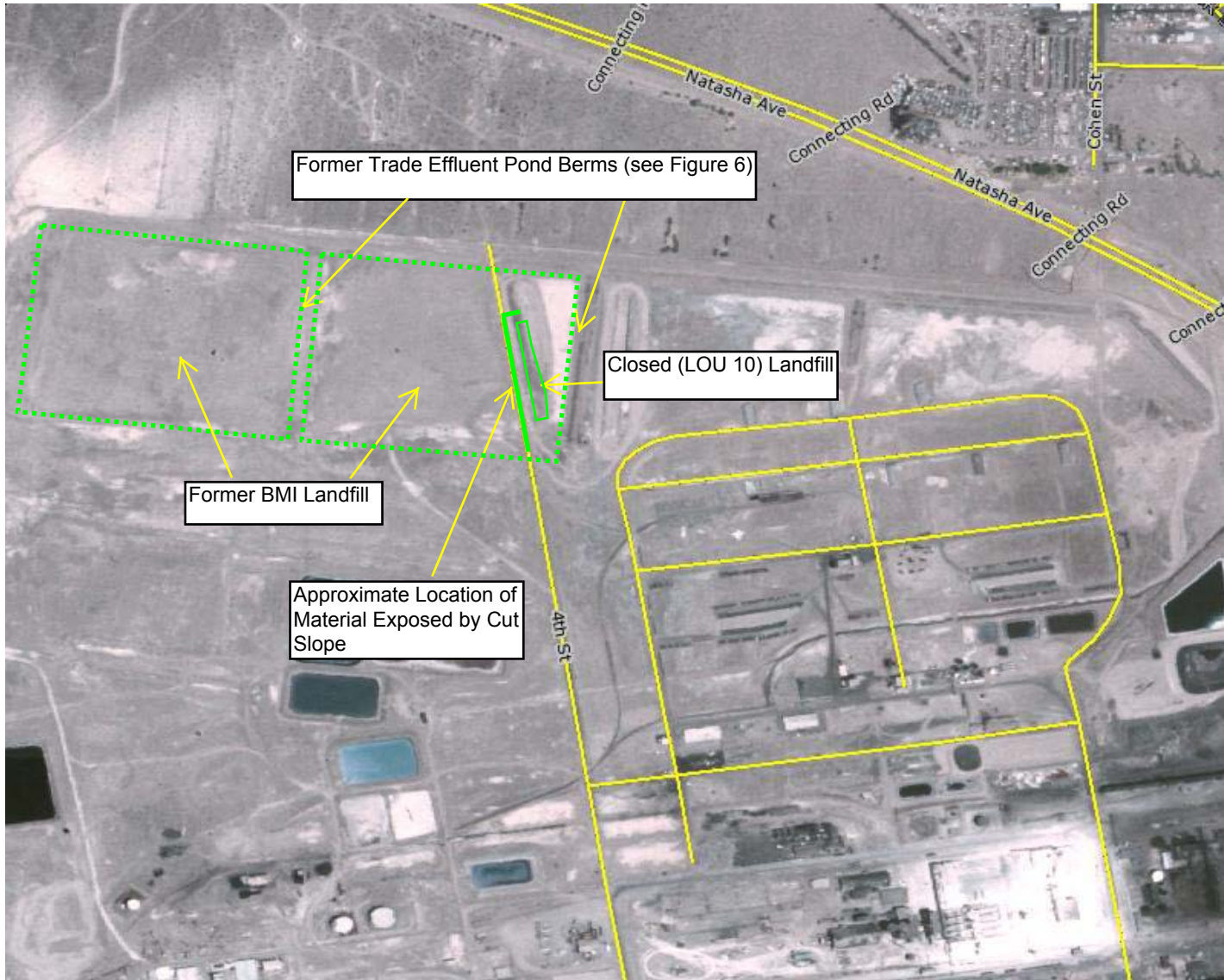
Figure 5 – Aerial Photograph 1983