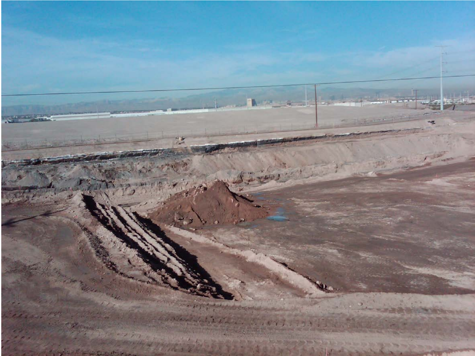
Figure 2 – Cut Area