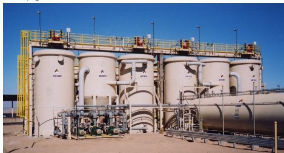
Biological Treatment Plant for Groundwater