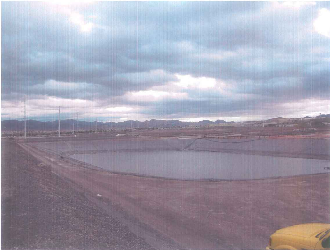
WC-East Pond ( Dec 29 th , 2010 )