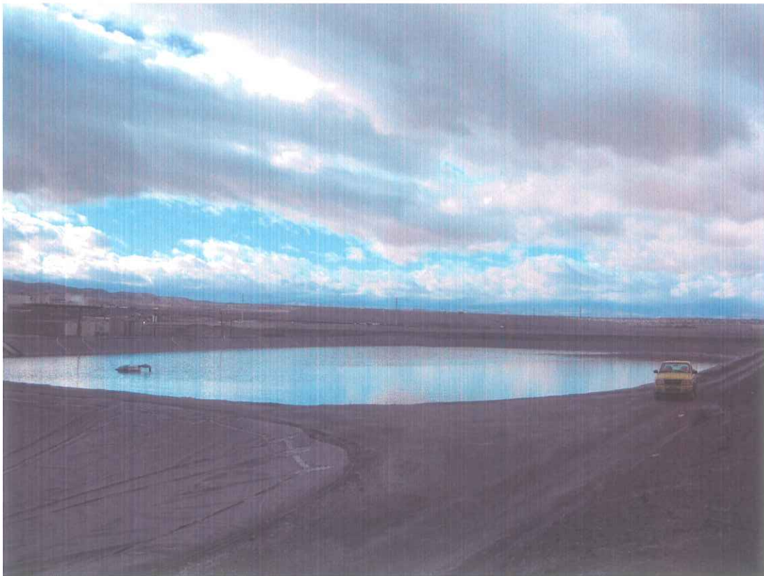
WC-West Pond ( Dec 29 th , 2010 )