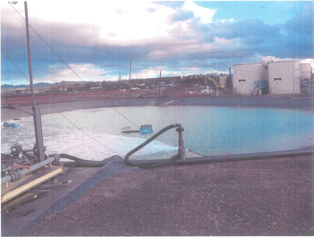
AP-5 Pond ( Dec 29 th , 2010 )