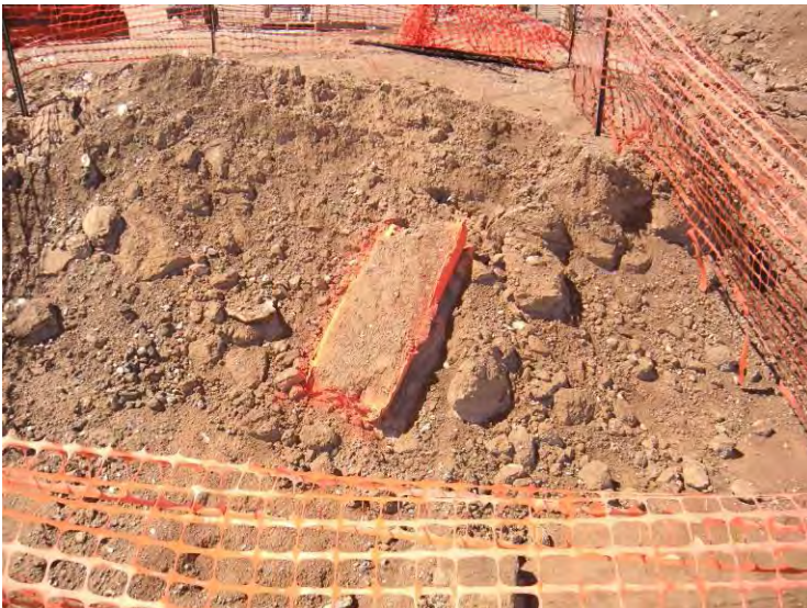
3. View of fibrous cement material.