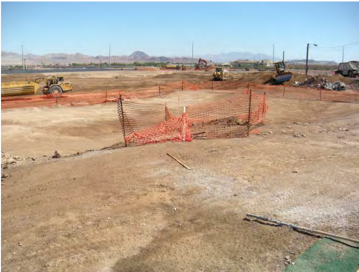
1. View is north/northeast at the location of the fibrous cement material.