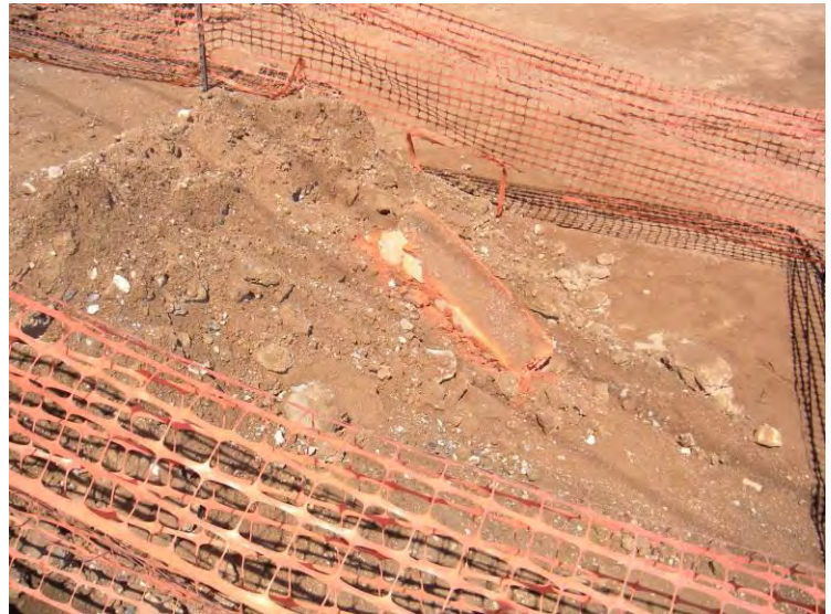
2. View of fibrous cement material.