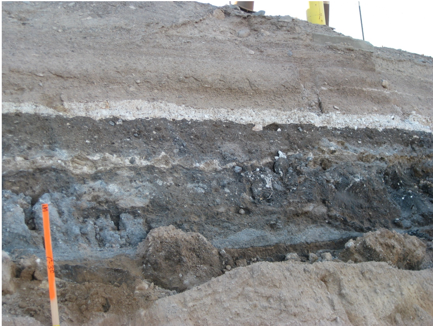
Figure 3 – View of Material