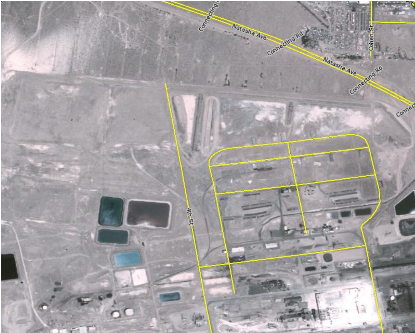
Figure 5 – Aerial Photograph 1983