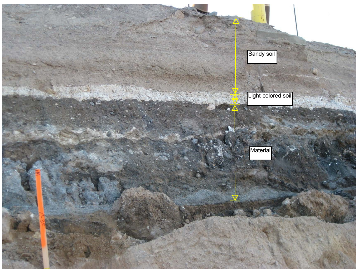
Figure 3 – View of Material