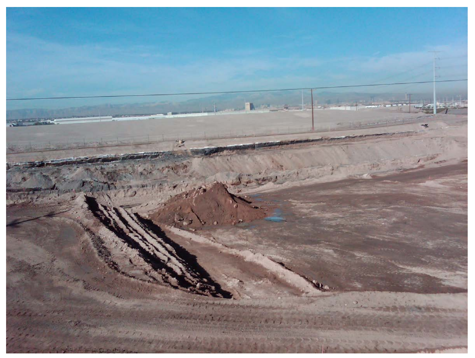
Figure 2 – Cut Area