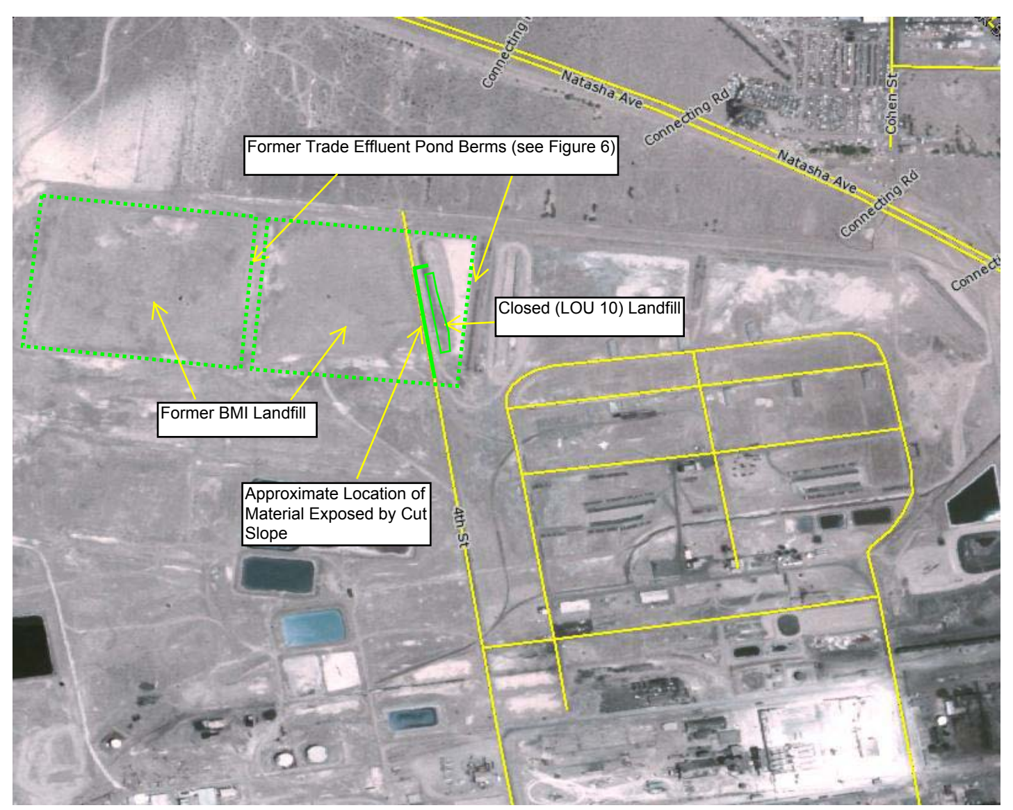
Figure 5 – Aerial Photograph 1983