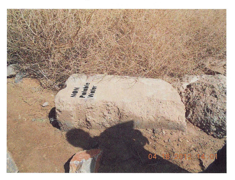
Fig. 14 – Footpath Marking