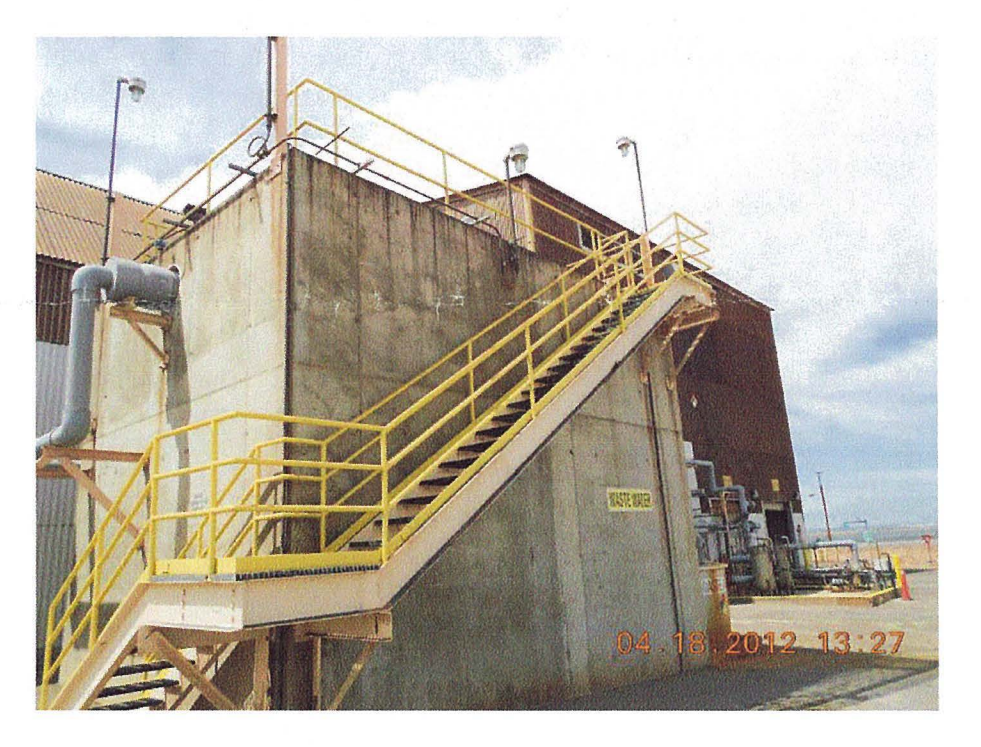
Fig. 11 – Filter (side view)

<u>Filtration</u>: The sand-media gravity filter, an add-on unit to this design in 2007, polishes the effluent prior to the final outfall. Veolia staff removed a safety grating panel on top to allow a view of the clear, odorless effluent.