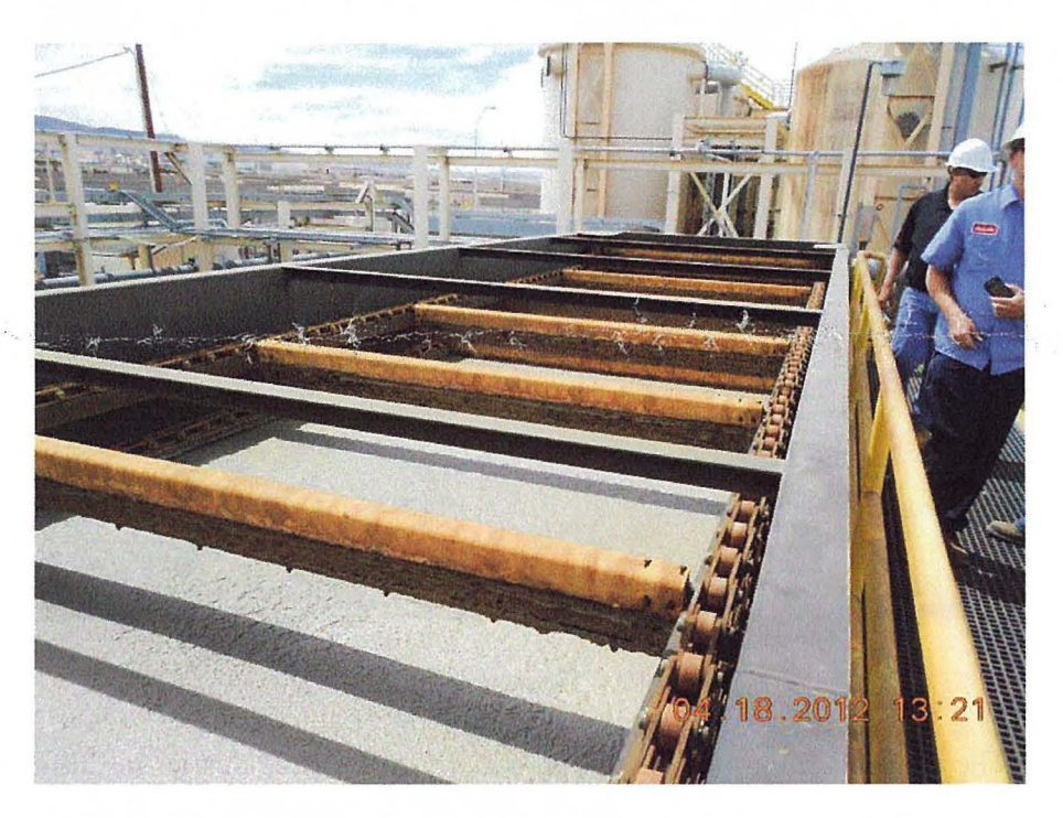
Fig. 8 – DAF Solids

Plant for remediation of a separate perchlorate plume (i.e. PEPCON plume) under authorization of NPDES Permit # NV0024112 is planned for a period of time to haul its waste floc to the Veolia Water Co. at BMI for final dewatering. The AMPAC treatment facility will be located two miles north of the Veolia Water Treatment Plant.