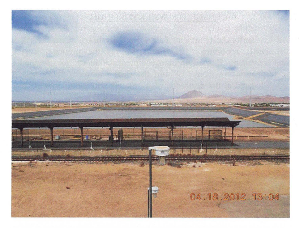
Fig. 3 – Pond GW-11 (background)

<u>Pretreatment</u>: Chromium pretreatment from the onsite wells (26) includes aeration and ferrous sulfate addition. Hexavalent chrome is reduced to the trivalent form and precipitated out with ferric oxide (rust). The precipitate is dewatered and landfilled.