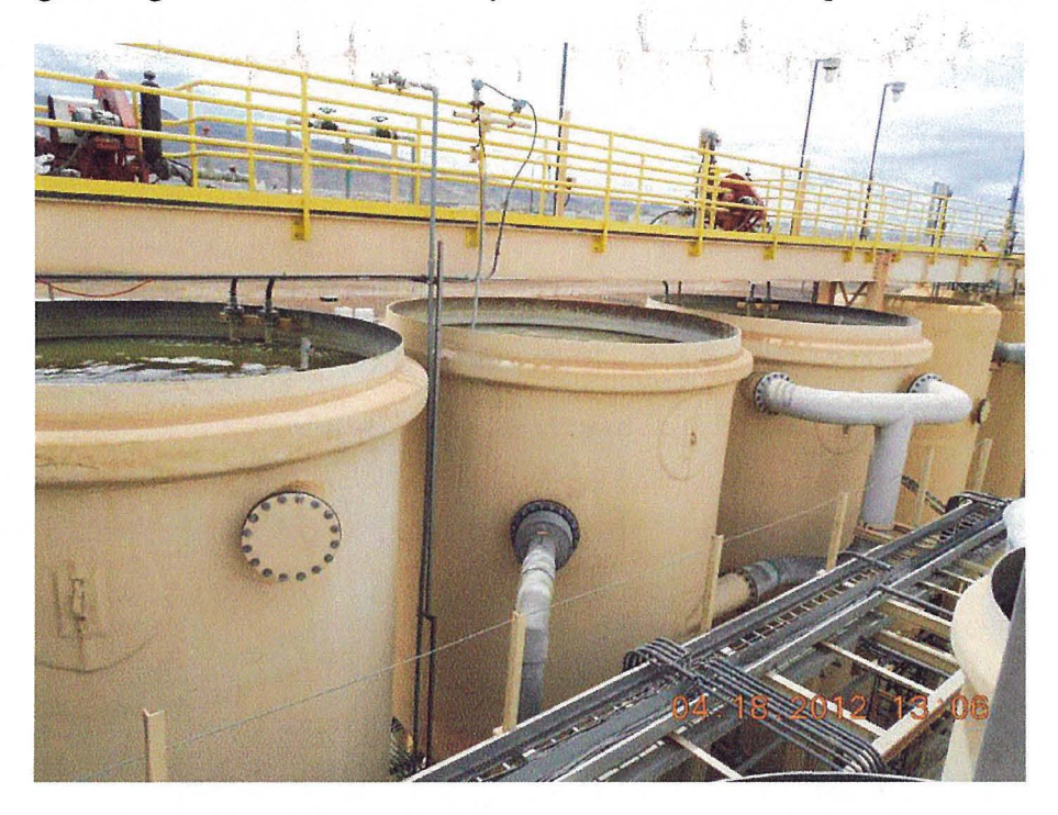
Fig. 5 – Front Stage FBRs

<u>FBRs</u>: There are five front-stage (sand bed) and four back-stage (carbon or GAC bed) anoxic, fluidized bed biological reactors with most of the perchlorate removal occurring in the front-stage reactors. Denitrifying (e.g. Pseudomonas ) bacteria, sourced from other denitrifying facilities, are sustained in the bed media with the addition of ethanol and micronutrients (N and P). The bacteria reduce preferentially: nitrate (1<sup>st</sup>), chlorate (2<sup>nd</sup>), perchlorate (3<sup>rd</sup>), and then sulfate (last). After the FBRs, hydrogen peroxide is added to the effluent to oxidize the corrosive and odorous sulfides back to the sulfate form for effluent odor control. Excess microbial floc is wasted through the cone separators on each reactor pair to the DAF for thickening and later dewatering. GAC air scrubbers control the gaseous sulfide emissions emanating from the FBRs. During the walkthrough, a slight sulfide odor was only detectable while on top the service catwalk.