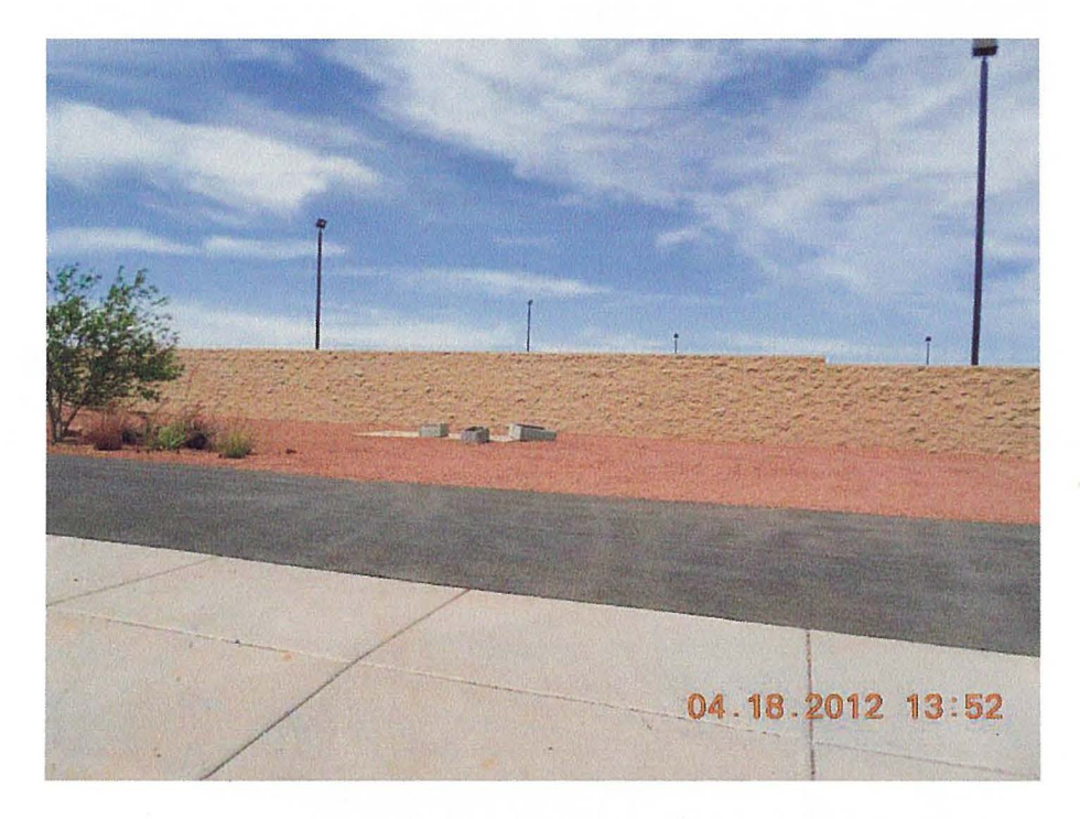
Fig. 2 – Athens/Galleria Well

<u>Groundwater</u>: Groundwater collected from the extraction well collection areas is combined in Pond GW-11, authorized under NEV2001515. This double-lined EQ basin holds 70 Million Gallons. The perchlorate level in the groundwater plume is highest in the on-site wells.