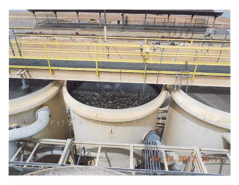
Fig. 6 – Back Stage FBRs