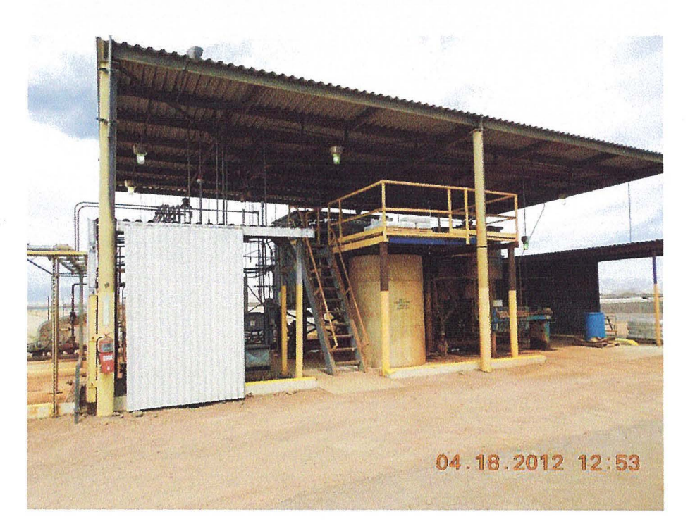
Fig. 4 – Pretreatment Plant

<u>Pretreatment</u>: Chromium pretreatment from the onsite wells (26) includes aeration and ferrous sulfate addition. Hexavalent chrome is reduced to the trivalent form and precipitated out with ferric oxide (rust). The precipitate is dewatered and landfilled.