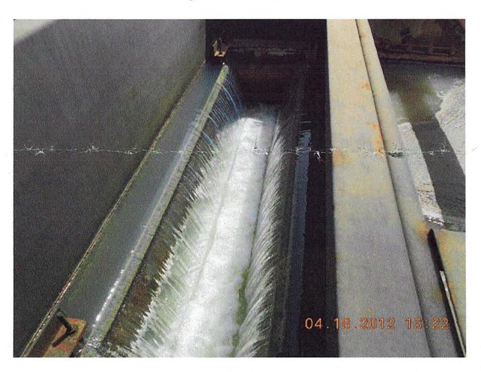
Fig. 9 – DAF Effluent (to filter)