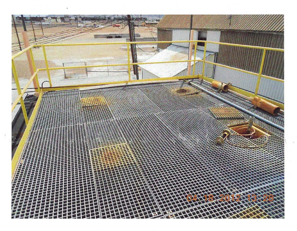
Fig. 12 – Filter (top view)

<u>Outfall</u>: The NERT outfall is located on the Las Vegas Wash, 3 miles NNW of the Veolia Water Treatment Plant. The outfall is located just upstream of the Pabco Rd. Weir, and the NERT effluent merges into the wash just downstream of another BMI outfall discharging effluent from the Tronox and Timet facilities. The NERT outfall structure has been painted to denote "Non-Potable Water". The footpath to this outlet is similarly stenciled since it is located in a habitat restoration area of the publicly accessible county's wetlands park. Habitat restoration at this outfall includes removal of invasive tamarisk (salt cedar) and planting of native species including bulrush, cattails, salt brush, and alkali sacaton grass.