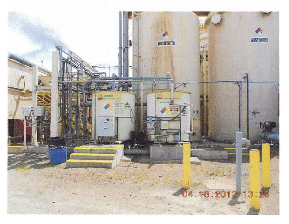
Fig. 7 – GAC Odor Control for Gaseous Emissions

<u>DAFs</u>: Parallel DAF units are used for thickening the waste floc, which is then dewatered using a plate and frame filter press. The DAF effluent appeared visibly clear although it is additionally filtered. The filter cake has a dull grey color and no noticeable odor. When completed in fall 2012, the AMPAC (American Pacific) FBR Treatment