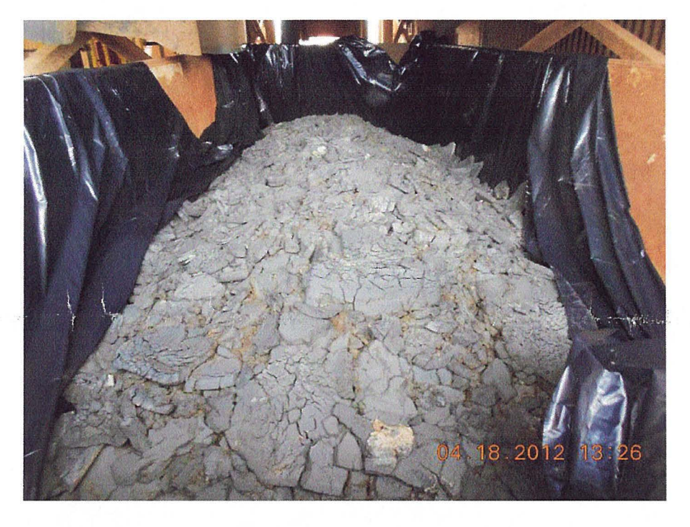
Fig. 10 – Dewatered Floc

<u>Filtration</u>: The sand-media gravity filter, an add-on unit to this design in 2007, polishes the effluent prior to the final outfall. Veolia staff removed a safety grating panel on top to allow a view of the clear, odorless effluent.